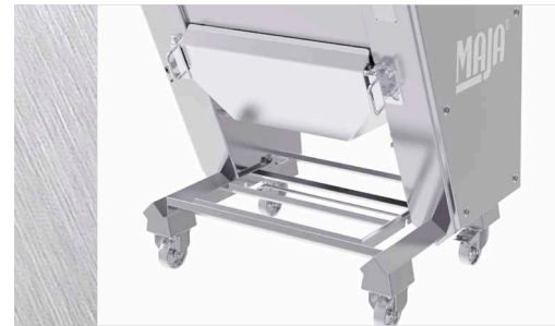
EVM 5004: membrane chute