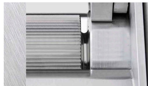
Cleaning-friendly design: hygiene radius on the transport / scraper roller