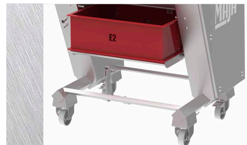
EVM 5006: Skin box support