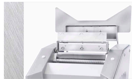
EVM 5006: Cleaning position