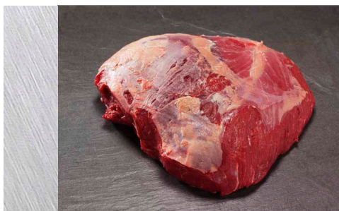
e.g. beef rump before...

QR-Code: For a first idea about the MAJA membrane skinning technology.