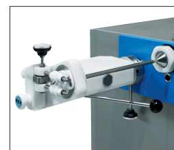
Holding device 370